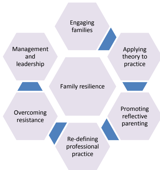
The process of embedding the Solihull Approach

Mixed methods study: questionnaire survey and in depth qualitative interviews carried out in 2013, in the north of England, to evaluate how health visitors and other practitioners (school, nursery and community psychiatric nurses, and the wider children and families team) embed the Solihull Approach into their practice, the benefits of doing so and barriers to more consistent implementation across the whole service.